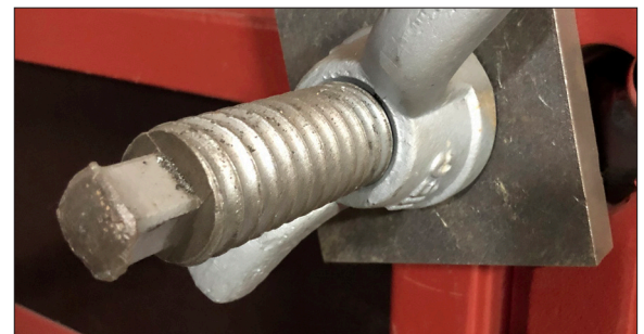
Hitting Taper Ties on the squared end will avoid thread damage and stripping difficulty.