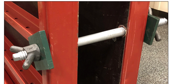
An assembly consists of the Taper Tie, two Flat Washers, and two Wing Nuts.