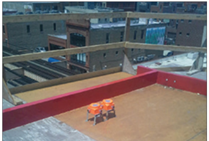
Ends can be overlapped or Slab Edge Corners and Fillers can be supplied to match the floor plan.