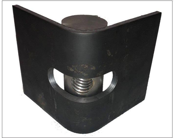
The Weld-On Pivot Bracket consists of a bent plate and pivot bar with threaded hole. The threaded tie rod to match the forming condition is sold separately.

To insure proper engagement the threaded tie rod must pass through the pivot bar a minimum of one diameter of the rod. An easy way to accomplish this is to position the tie rod perpendicular to the piling and thread it through the pivot bar until it comes in contact with the piling.