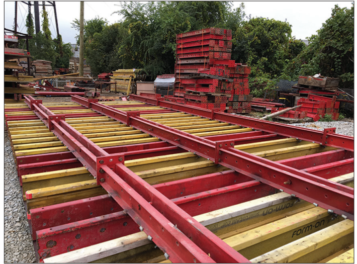
Butt Plate Walers, bolted together end-to-end, are used to support this large wood beam gang.

The Double Channel Waler is another common waler design. Double 5" steel channels have 13/16" holes for 3/4" bolts, spaced on 6" centers, for waler attachment hardware. The steel channels are positioned back-to-back and separated by a 3" gusset or spacer. (See following page for sizes)