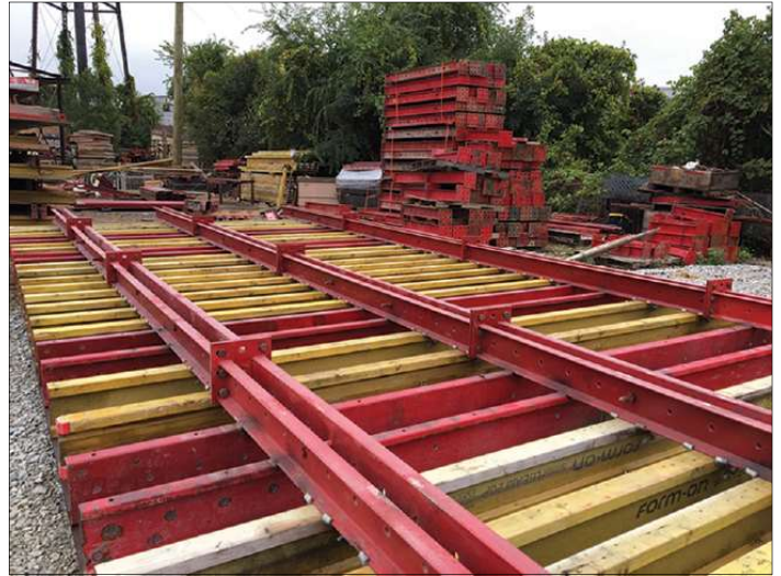
Butt Plate Walers, bolted together end-to-end, are used to support this large wood beam gang.

The Double Channel Waler is another common waler design. Double 5" steel channels have 13/16" holes for 3/4" bolts, spaced on 6" centers, for waler attachment hardware. The steel channels are positioned back-to-back and separated by a 3" gusset or spacer. (See following page for sizes)