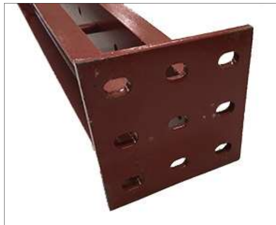
Butt Plate Walers have 1/2"x9"x9" end plates with slotted holes for end-to-end connections.