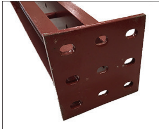
Butt Plate Walers have 1/2"x9"x9" end plates with slotted holes for end-to-end connections.