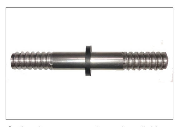
Optional neoprene waterseal available on request.