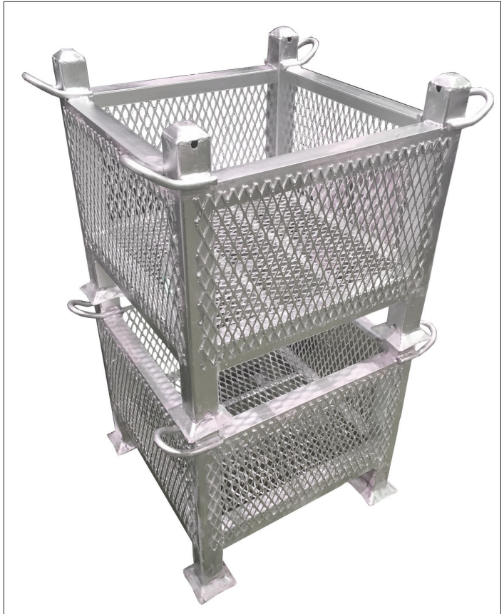
Sturdy steel mesh containers hold up to 3,500 lbs for sorting, stacking, storing and moving parts.

It's easier to keep inventory organized and accessible with a Hardware Basket.