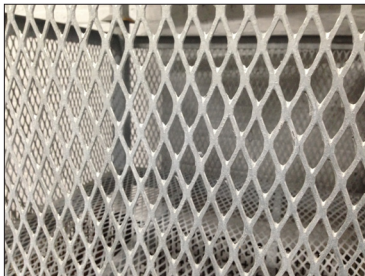
Galvanized mesh resists corrosion and permits any dirt to fall through the openings.