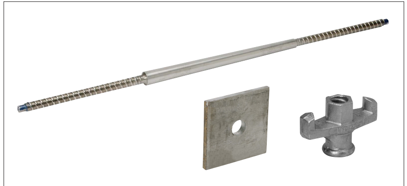
The Euro Taper Tie, two Flat Washers and two Wing Nuts provide a removable and reusable gangform tie system.

Euro Taper Ties have flats at the larger end, allowing the tie to be turned with a wrench during stripping. A hammer is used to strike the tie on the smaller end for removal from the gangform and wall.