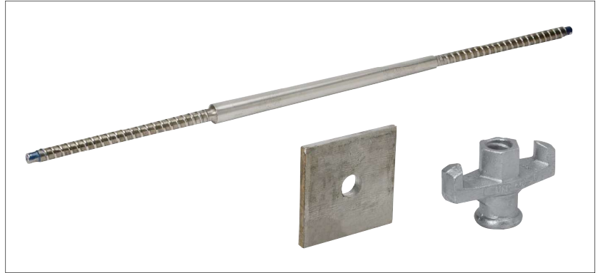
The Euro Taper Tie, two Flat Washers and two Wing Nuts provide a removable and reusable gangform tie system.

Euro Taper Ties have flats at the larger end, allowing the tie to be turned with a wrench during stripping. A hammer is used to strike the tie on the smaller end for removal from the gangform and wall.