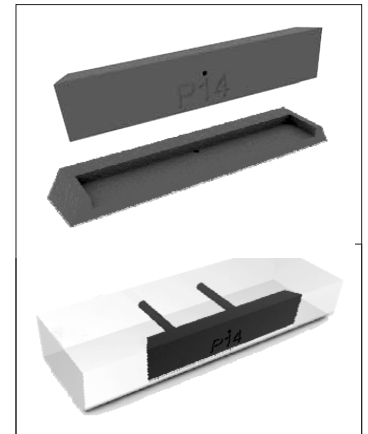
Reusable rubber former.

** Capacity based on 5,000 psi concrete.