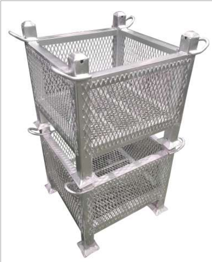
Sturdy steel mesh containers hold up to 3,500 lbs for sorting, stacking, storing and moving parts.

It's easier to keep inventory organized and accessible with a Hardware Basket.