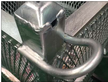
Corner lugs provide reliable attachment points for lifting and moving the basket.